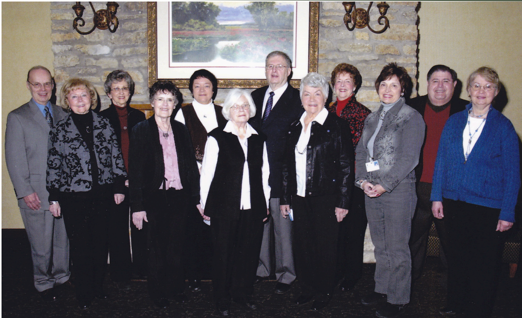
E.A.R.T.A. Board of Directors on February 11, 2011